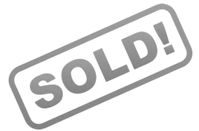
PHOTO BOOTH SPONSOR